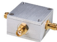
SMA version shown CASE STYLE: K18

Level 7 (LO Power +7 dBm) 100 to 2000 MHz